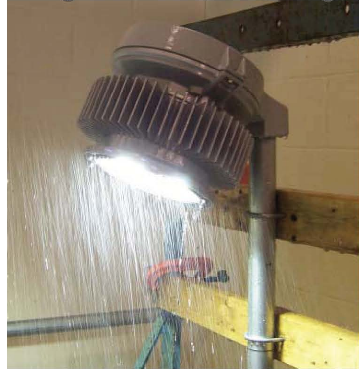
Ingress Protection Testing

Result: NEMA 4X, IP66 Wet & Marine Location