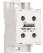
Finger-safe PDBFS Power Distribution Blocks****