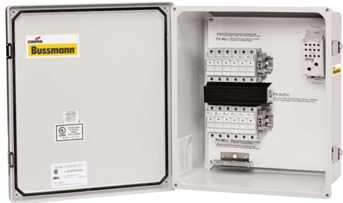
BCBS Series Standard Box (BCBS-12-30F)

Selection and quality - it's what's inside that counts