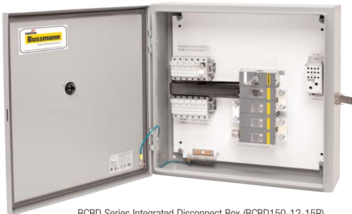
BCBD Series Integrated Disconnect Box (BCBD150-12-15R)