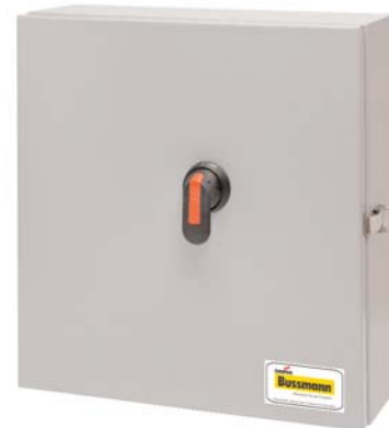
Shown with optional disconnect switch.