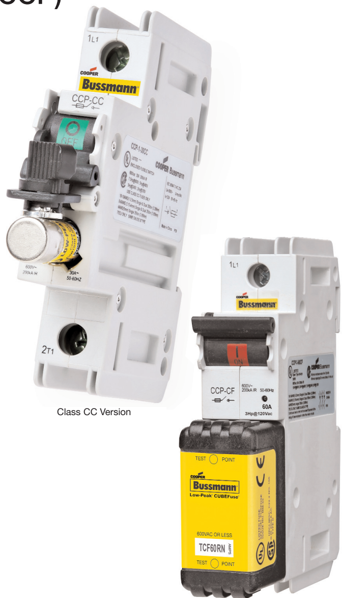
Class CC Version