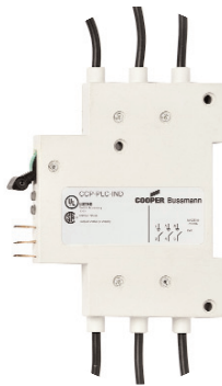
CCP-PLC-IND (Includes spade terminals)