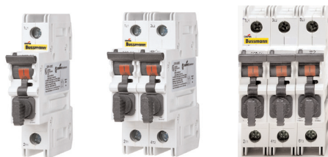
1-, 2-, and 3-pole Class CC and Midget CCP