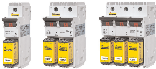
1-, 2-, and 3-pole 30A CUBEFuse CCP