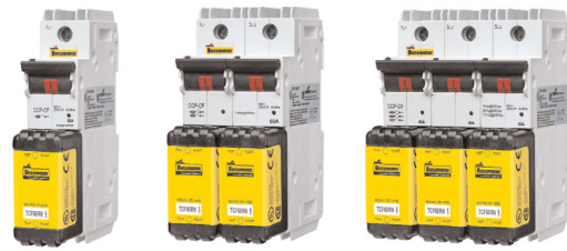
1-, 2-, and 3-pole 60A CUBEFuse CCP