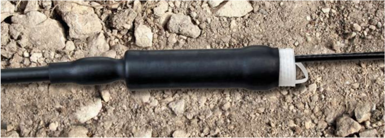
3M™ Cold Shrink Quick Splice Low Voltage QSLV-M